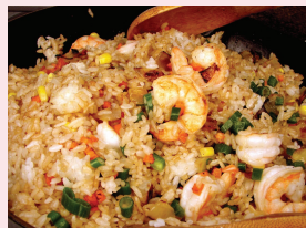
MEKONG FRIED RICE