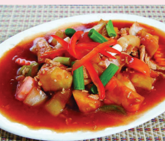
SWEET & SOUR