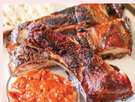
BBQ ROASTED PORK